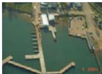
...and the finished pier