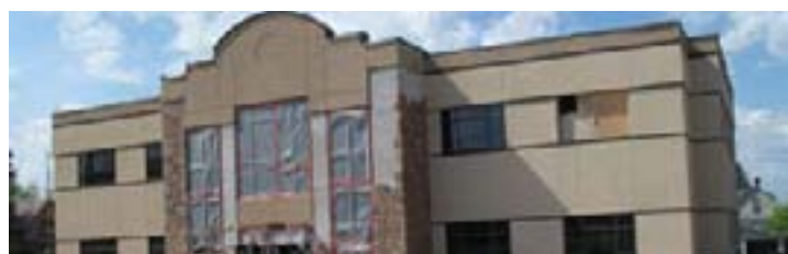
The nearly-completed new home of Enbridge Energy