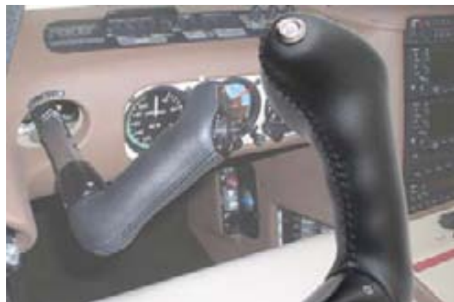
These SCS Aircraft Interiors photos show two examples of their detailed work